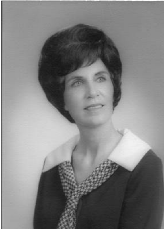
Earsel, about 1966