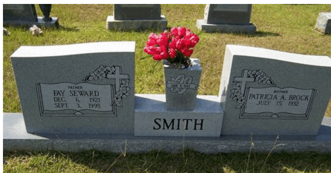
Photo from Silver Creek Cemetery, Dykes Crossing, Pike Co., MS