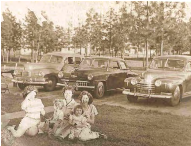
Our third car on the left, 46 Nash Ambassador. Don't worry about the girls in foreground, that's another story.

But the main thing was that ignition key which worked off the steering column and would lock the steering wheel when the key was removed. We lost our keys and you cannot imagine all the difficulties one had trying to deal with that in those days. Of course today I guess all ignition systems are keyed to the steering column.