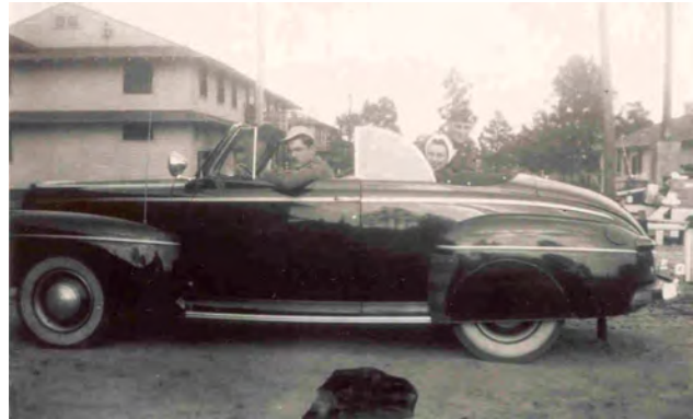
Our 2 nd car, 46 Ford convertible

We must have kept that car for about three years because when we replaced it we were living on the post in government quarters. There was no car production in the US in 1943-1945 because all the auto plants were in war production of a variety of products. As I remember we had just walked past this 46 Ford Convertible on a used car lot in Fayetteville and I thought we just had to have it. Remember we were all of 22 then. I don't know what the cost was for a plain 46 convertible, but the more expensive Ford Sportsman convertible, which had wood paneling on the sides and back like the old station wagons went for $1982. I also don't know what we paid for the used one, but I'm pretty sure there were car payments. Although Ford produced 467,413 cars this year, supposed to be 1 st in the industry according to Ford, the company posted a $8.1 loss. There were three things I learned to dislike about that car. First the rag top just was not tight enough and would let in cold air and some rain. I also thought the homemade skirts that the previous owner had screwed onto the back fenders looked cheap.