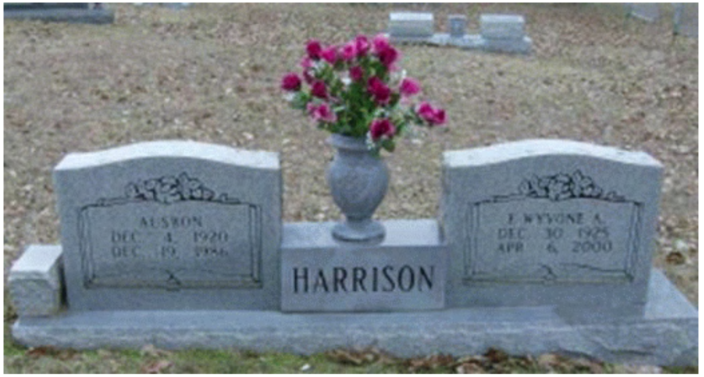
Photo from Hopewell Baptist Church Cemetery, Lake, Scott Co., MS

Colonial Chapel Funeral Home in Forest was in charge of arrangements.