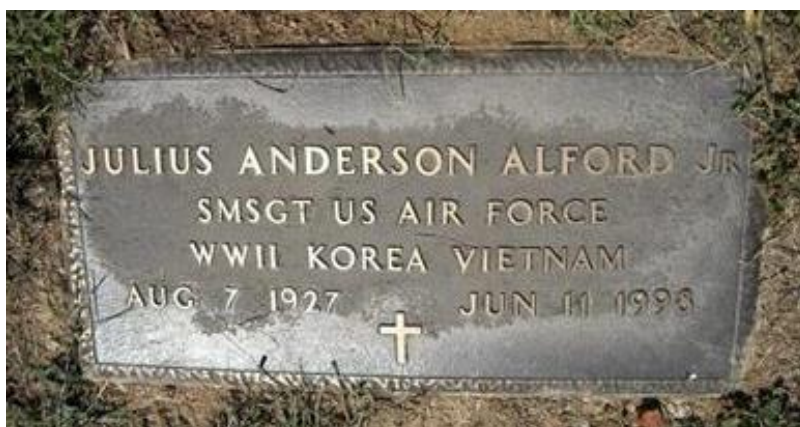
Photo from Mount Moriah Cemetery, Macon Co., GA Inscription: SMSGT US Air Force World War II Korea Vietnam