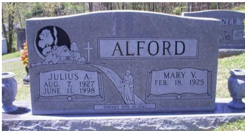
Photo from Mount Moriah Cemetery, Macon Co., GA Permission granted by the photographer, name withheld by request Photo posted 27 Jan 2014

Birth: 7 Aug 1927 Hinds County, Mississippi, USA Death: 11 Jun 1998 (aged 70) Highlands, Macon County, North Carolina, USA Burial: Mount Moriah Cemetery Macon County, North Carolina, USA Memorial ID: 79951724